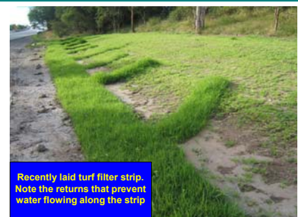
Recently laid turf filter strip. Note the returns that prevent water flowing along the strip